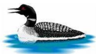
Mount Vernon Community Partnership Corporation, Inc.